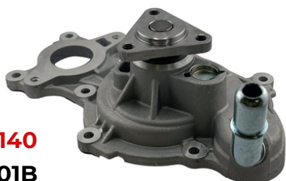
GMB #125-6140 OE#LK4Z8501B