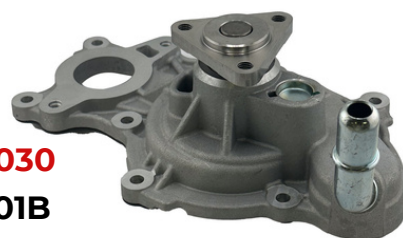
GMB #125-4030 OE#L1MZ8501B