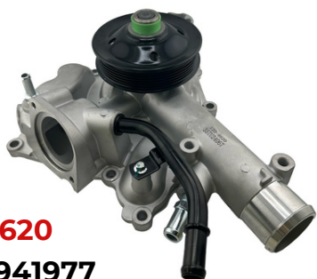
GMB #120-4620 OE#083286941977